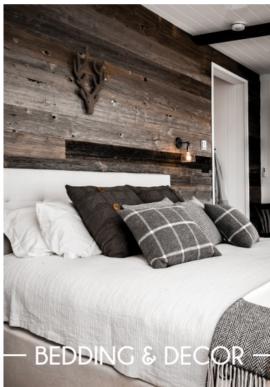
BEDDING & DECOR