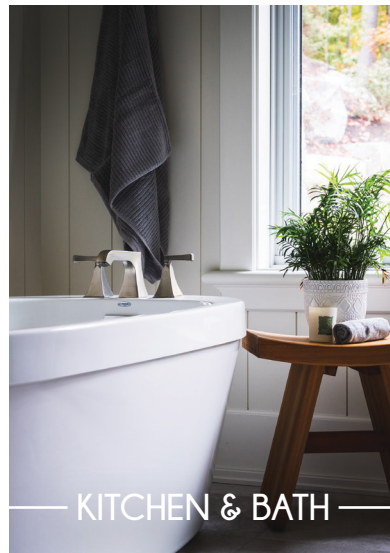
KITCHEN & BATH