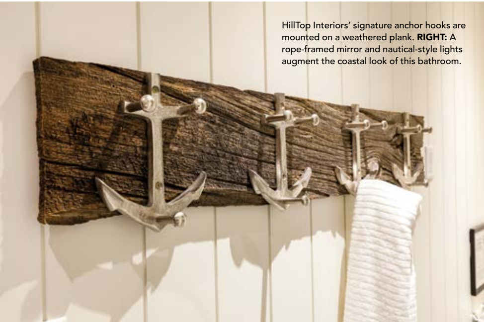
HillTop Interiors’ signature anchor hooks are mounted on a weathered plank. RIGHT: A rope-framed mirror and nautical-style lights augment the coastal look of this bathroom.