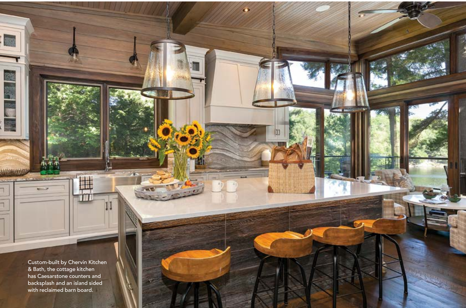
Custom-built by Chervin Kitchen & Bath, the cottage kitchen has Caesarstone counters and backsplash and an island sided with reclaimed barn board.

“It took us a long time to find our team and people who would honour what was there and make it better.”