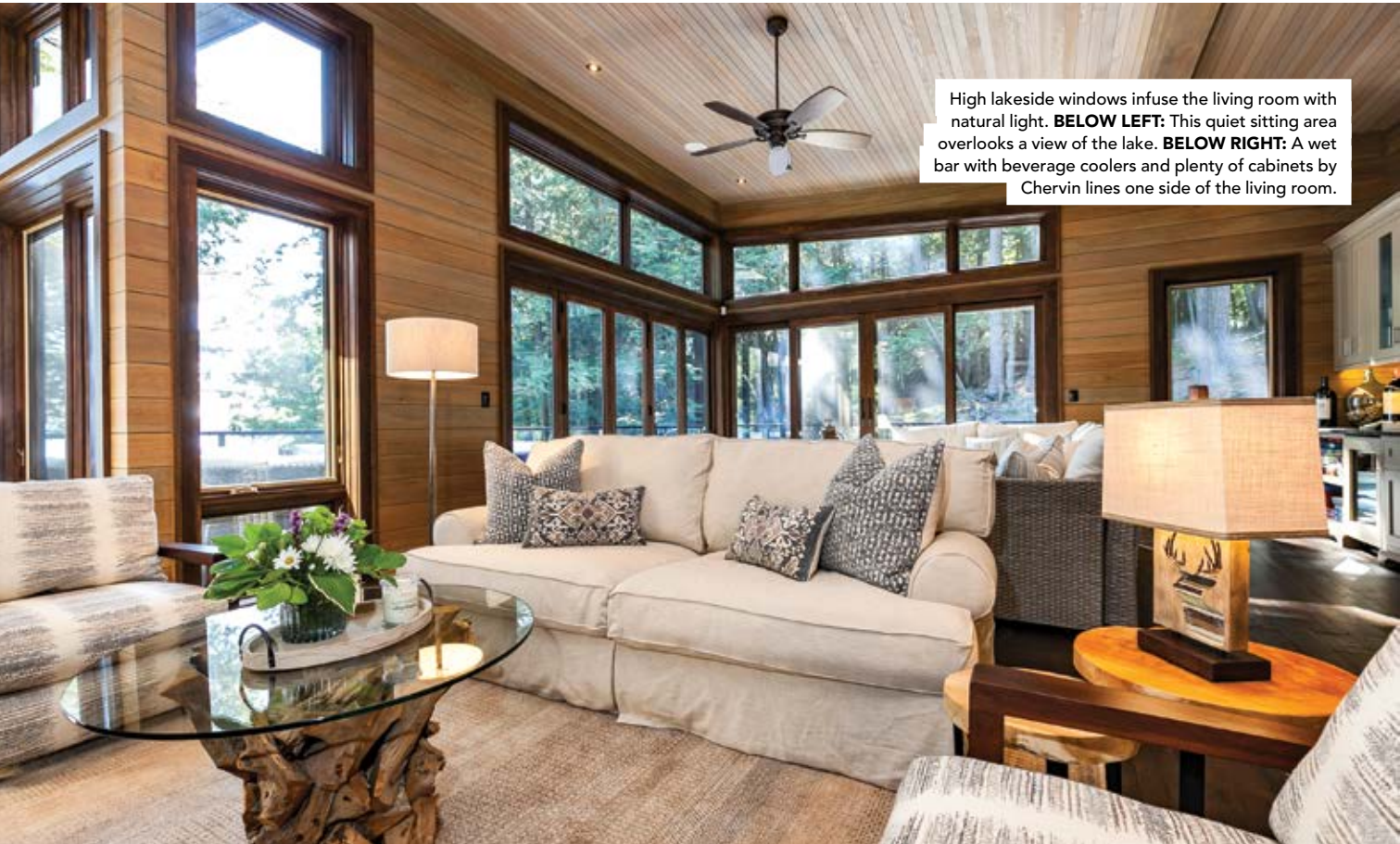
High lakeside windows infuse the living room with natural light. BELOW LEFT: This quiet sitting area overlooks a view of the lake. BELOW RIGHT: A wet bar with beverage coolers and plenty of cabinets by Chervin lines one side of the living room.

cottage, allowing large floor-to-ceiling windows that showcase the lake and shed lots of natural light on the living space. “We rebuilt the whole structure so we could have huge windows. That was really important to us,” says Leslie.