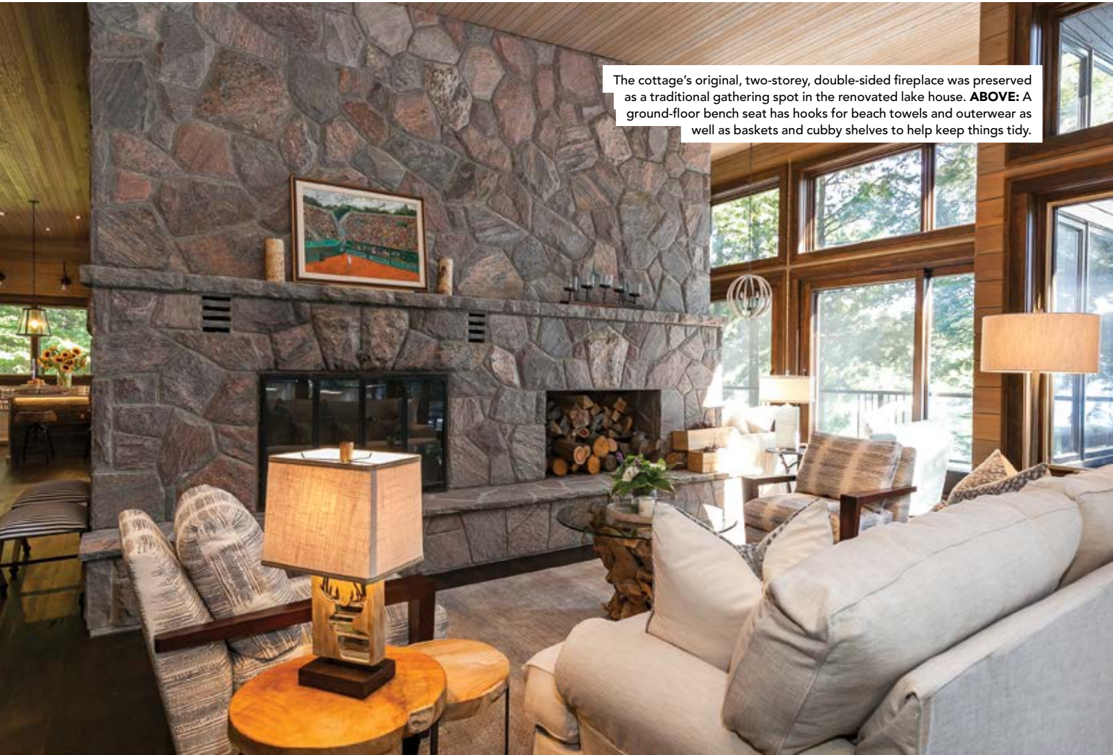
The cottage’s original, two-storey, double-sided fireplace was preserved as a traditional gathering spot in the renovated lake house. ABOVE: A ground-floor bench seat has hooks for beach towels and outerwear as well as baskets and cubby shelves to help keep things tidy.

worked together and it made the job so much easier.” The renovation created four bedrooms, including a suite with twin beds, bunk beds and a bathroom, all on the ground floor. The master bedroom on this lower level has a private seating area by the fire and its own en suite. Sliding doors in a lake-facing bedroom open to a large covered deck. HillTop Interiors furnished the entire cottage. On the upper floor, Robert’s crew removed the original exterior walls. They rebuilt the sloping roof so it ascends at the front of the