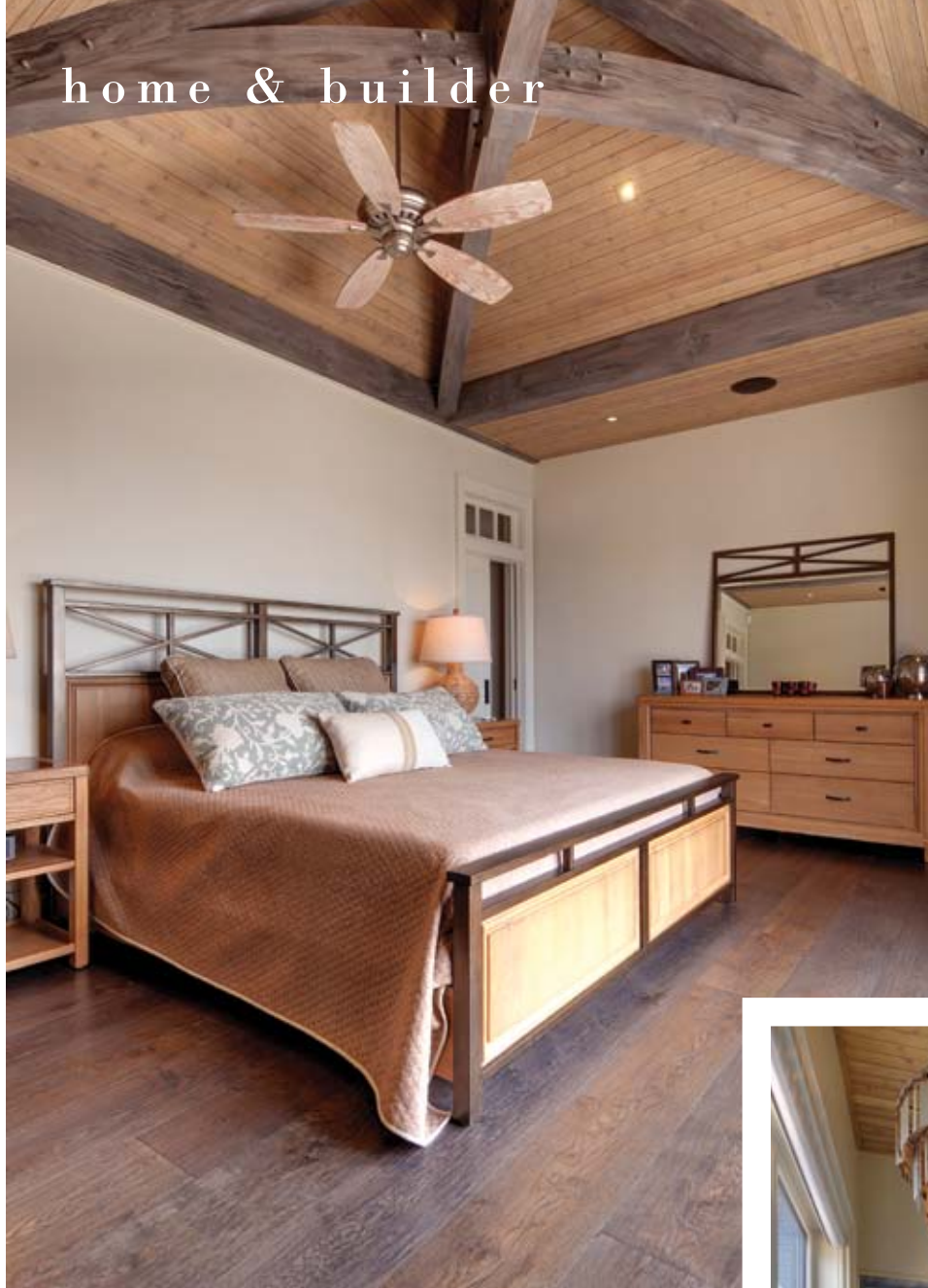
LEFT: Douglas fir beams, below a rough-sawn cedar ceiling, arch over the sleeping area of the master bedroom. BELOW: In the en suite, a sun-lit soaker tub sits atop ceramic tiles that resemble marble. OPPOSITE TOP: A rustic spot offers a spectacular view on the deck of an old bunky near the shore. OPPOSITE BOTTOM: Large bifold doors open to give the master bedroom an unobstructed view of the bay and its beautiful sunsets. GemThane Pre-Coated Wood Systems supplied the exterior siding.

Chris says that when it came time to sit down to begin the process of interior finishing, his starting point and really his only demand was the engineered oak floor of the main areas of the house. It was essentially to be the reference point for determining the rest of the colours and textures to be chosen. A 10-inch-wide, weathered plank look, with an earthy coloured slate stain, allows the grey granite of the house exterior to transition seamlessly to the interior, once again evoking a borderless feeling. The muted tones established by this relationship continue throughout the interior and are reflected in the paint and stain choices for the walls, windows, ceiling, as well as most of the furnishings.