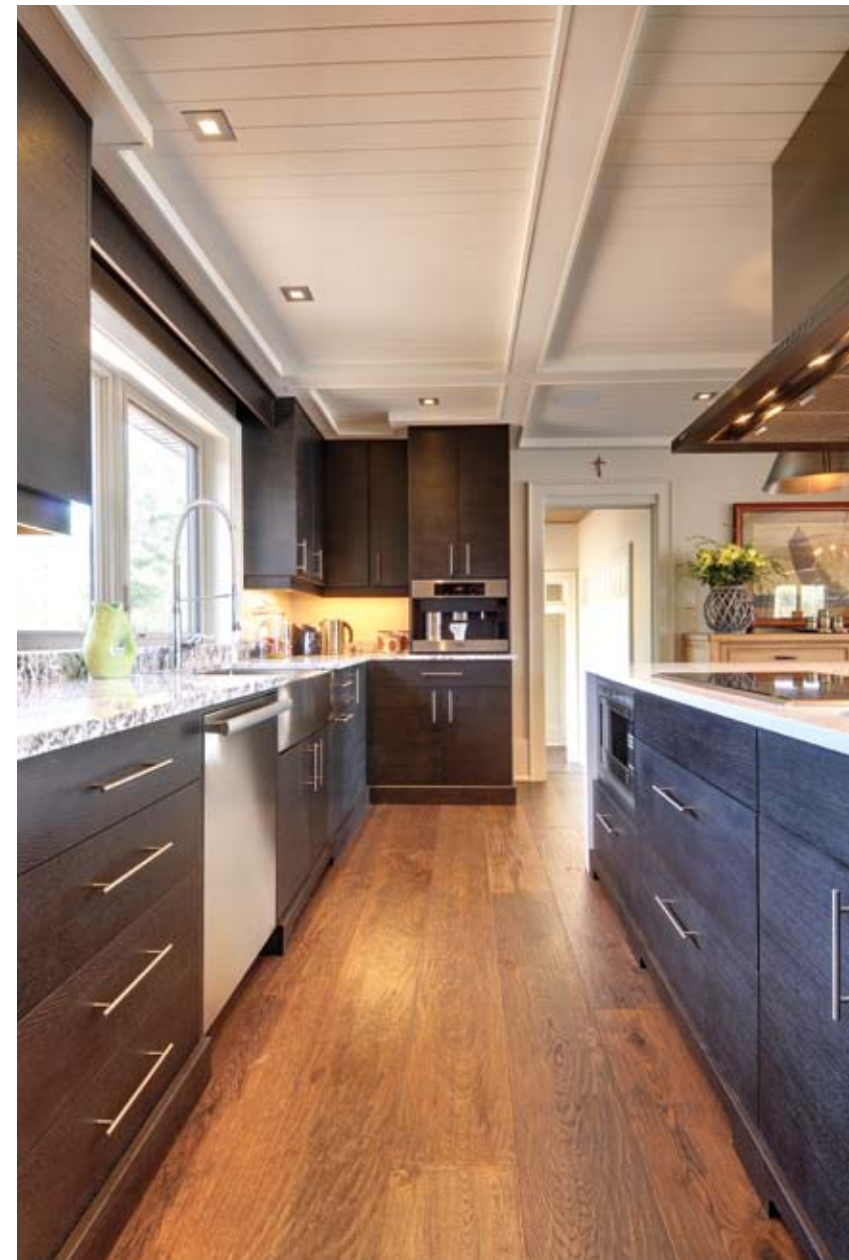
OPPOSITE: Family members and dinner guests can enjoy a stunning view with a delicious meal. Hilltop Interiors furnished the dining room table and chairs. LEFT: Engineered oak flooring helps give the kitchen an air of efficiency. BELOW: Hilltop also supplied the dinnerware and dining room chandelier. BOTTOM: Located just off the kitchen, the well-equipped laundry room includes a built-in ironing board.