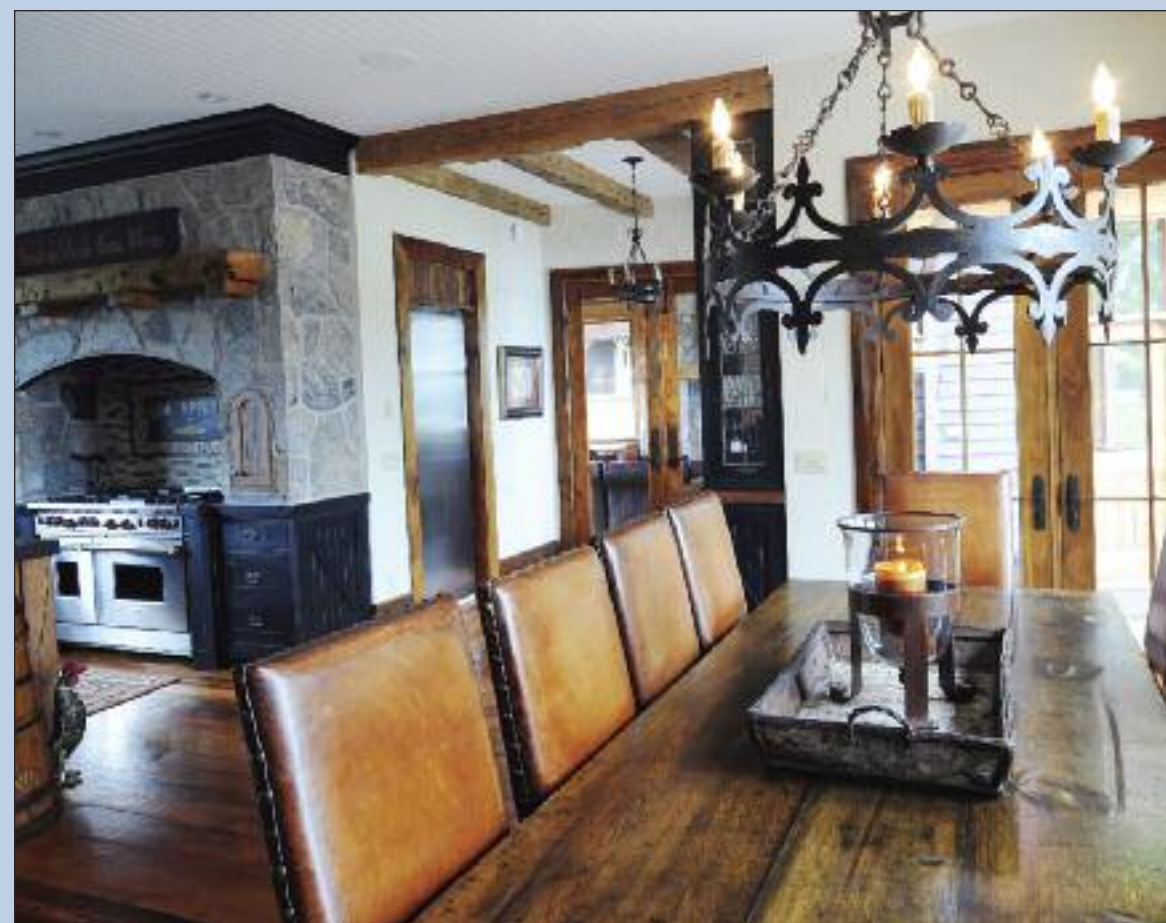
(Clockwise from top left) The front doors were custom built by the Cutting Brothers in Port Carling. Kody, Wendel, Kylie (back row), Denise and Kassie and family dog Toby enjoy the cottage. The dining room seats 10. The master bedroom features double sinks, a soaker tub and a granite shower.