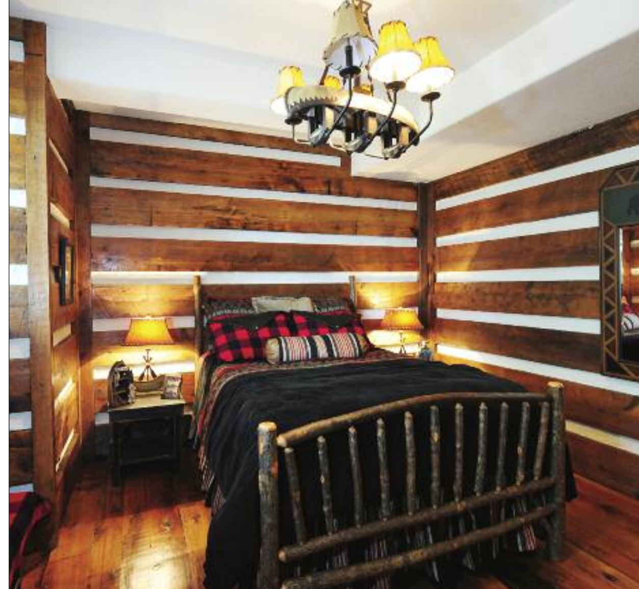
Kody Clark's bedroom at the cottage is reminiscent of a rustic log cabin.