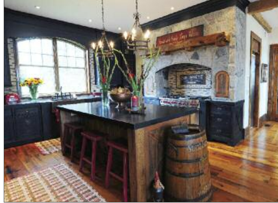
A large island in the kitchen (above) was a must for the busy family . A sample of Wendel Clark's line of wine (left).

with a group of guys, including Doug Gilmour, Kirk Muller and Dave Ellett.