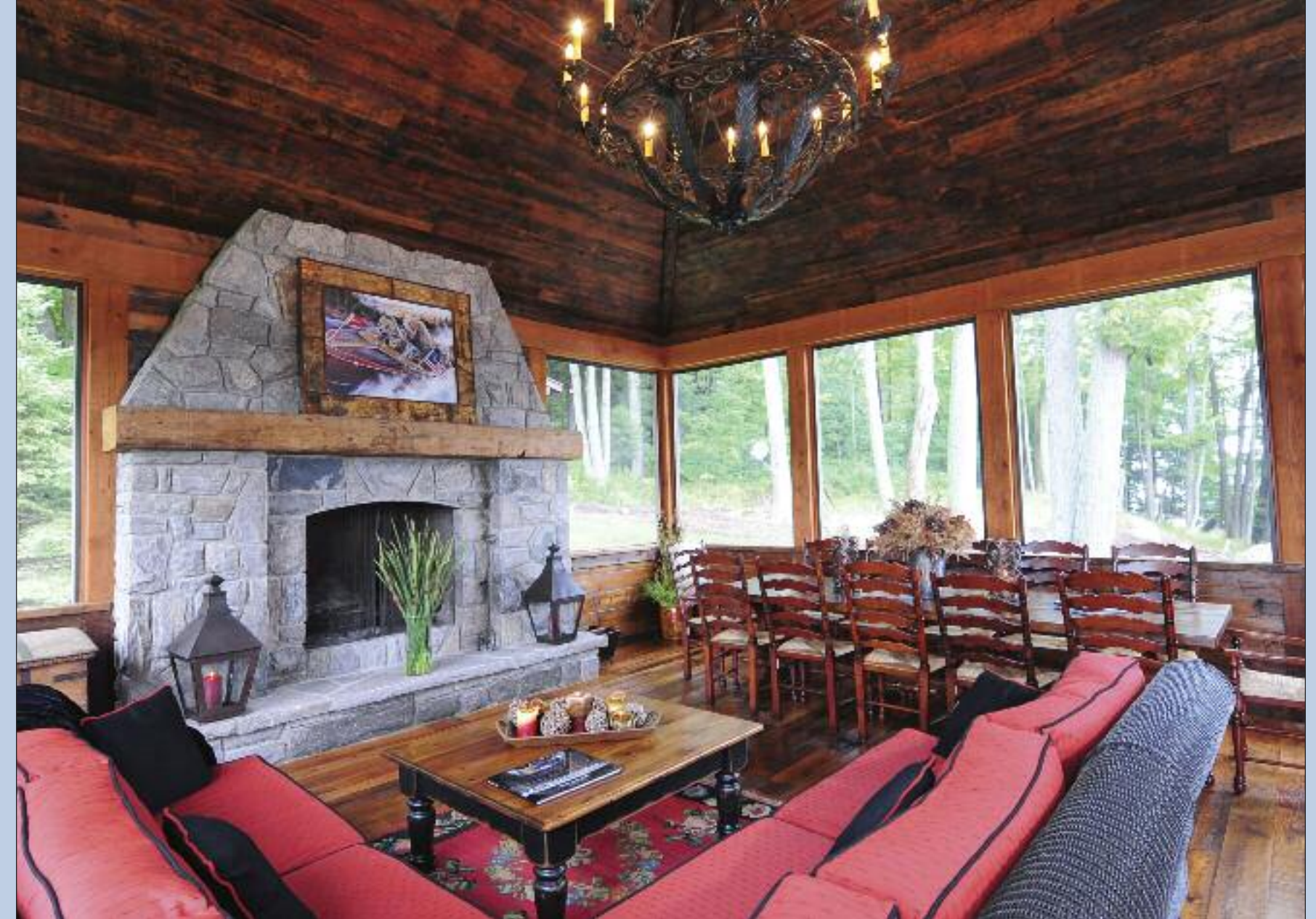
The ceiling and floors in the Muskoka Room, which features a table that seats 12, are made of reclaimed hemlock (above). The powder room is accentuated with antiques (below). The washstand came from a farm in the United States.