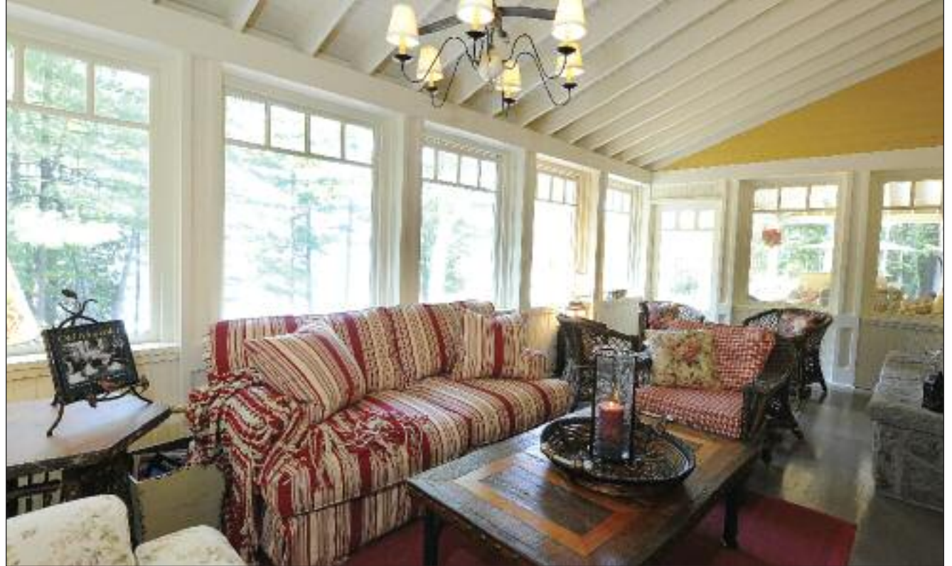
The enclosed veranda is a perfect spot to relax and spend some time on rainy afternoons.

If you’re thinking of selling or buying a cottage this fall... Call us! We’re here to help you.