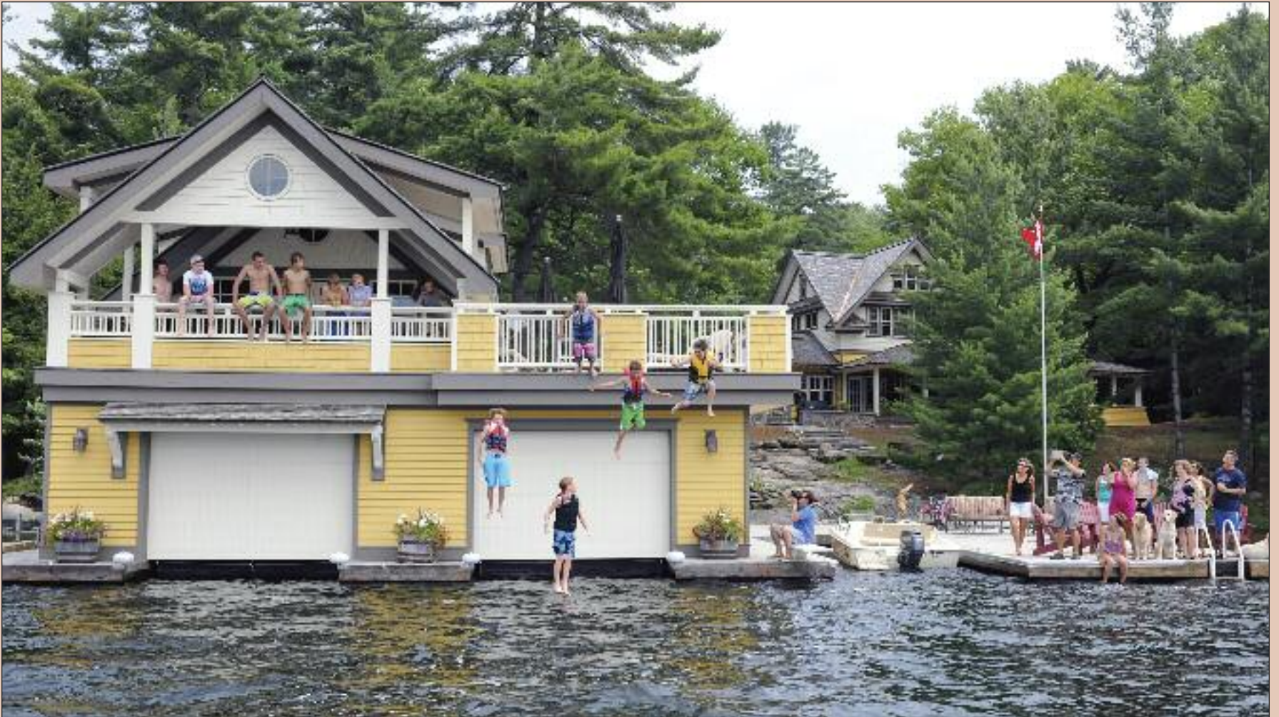
A crowd of friends and family gather on the dock to watch the kids jump off the sunny, yellow boathouse (above). The living room is decorated to be an inviting area with lots of room for entertaining the many guests at the cottage (below).