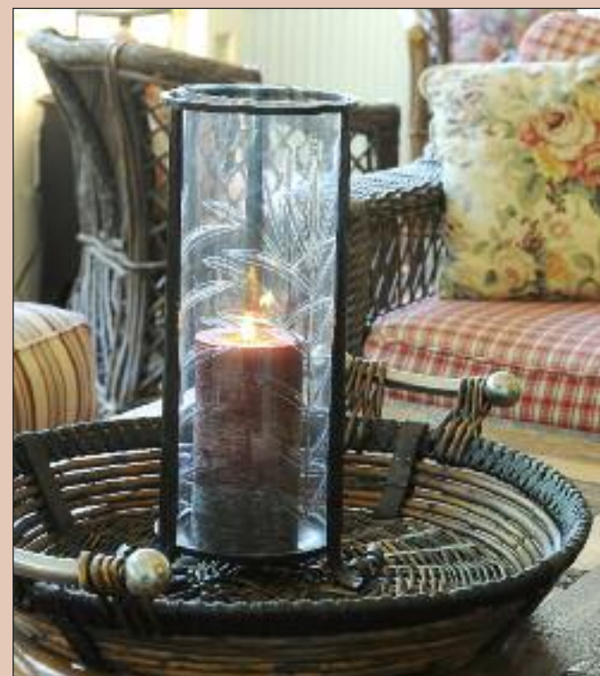
A lit candle adds to the relaxed décor of the screened porch at the cottage.

This type of architecture is something with which Robert is very familiar with and comfort-