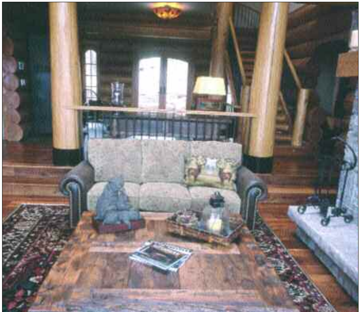
Furniture in a log home must be solid, like the structure itself. In the Westwood, the designer chose large sofas that combined cloth and leather for many of the rooms.