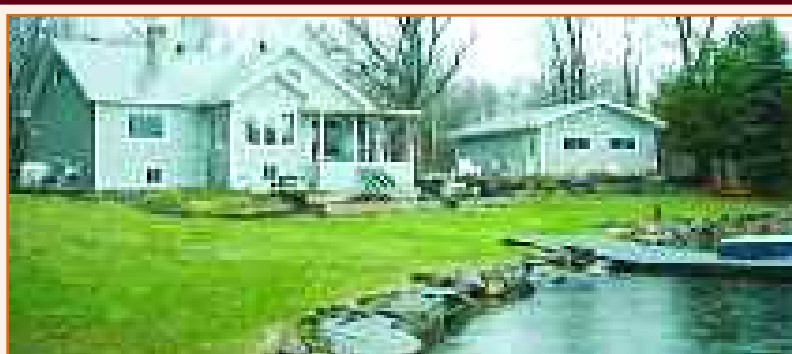
JOSEPH RIVER/LAKE ROSSEAU