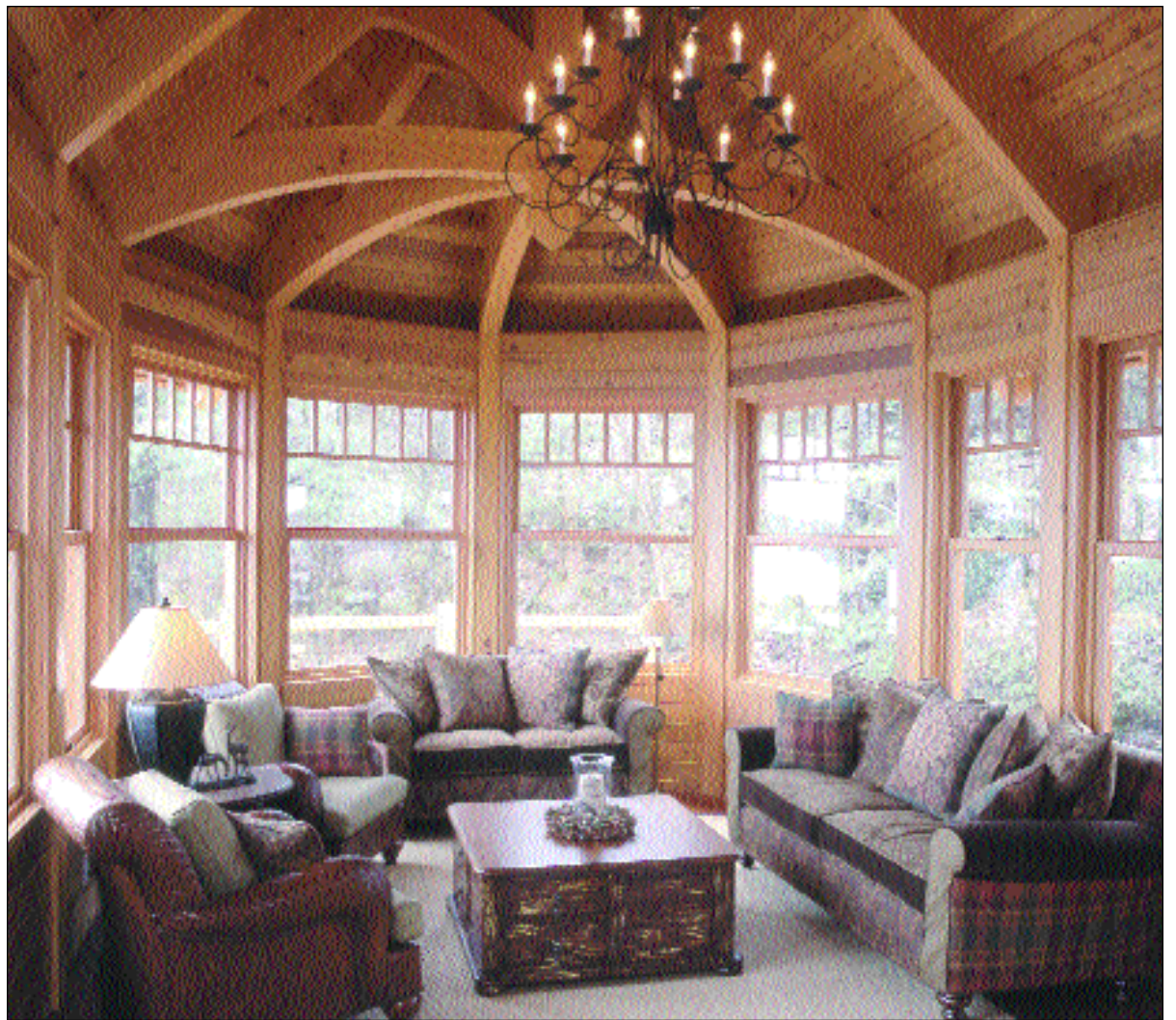
This impressive Muskoka room was originally designed for seasonal use but the new owners decided they wanted to be able to use the beautiful space all year.

One such piece is an armoire, located in the entrance area. At over eight feet tall, the armoire was designed by Nitty Gritty of Toronto to be the focal point of the room. It has the name Westwood hand painted in birch twig style and drawers made of the actual cut-offs from the western red cedar logs used in building the home.