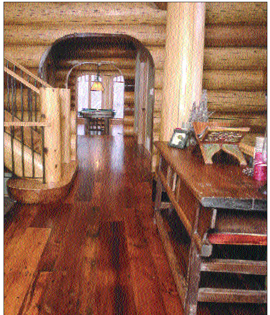
At the end of this hall is a bright, well-equipped games room. Using various types of wood and finishes added warm tones.