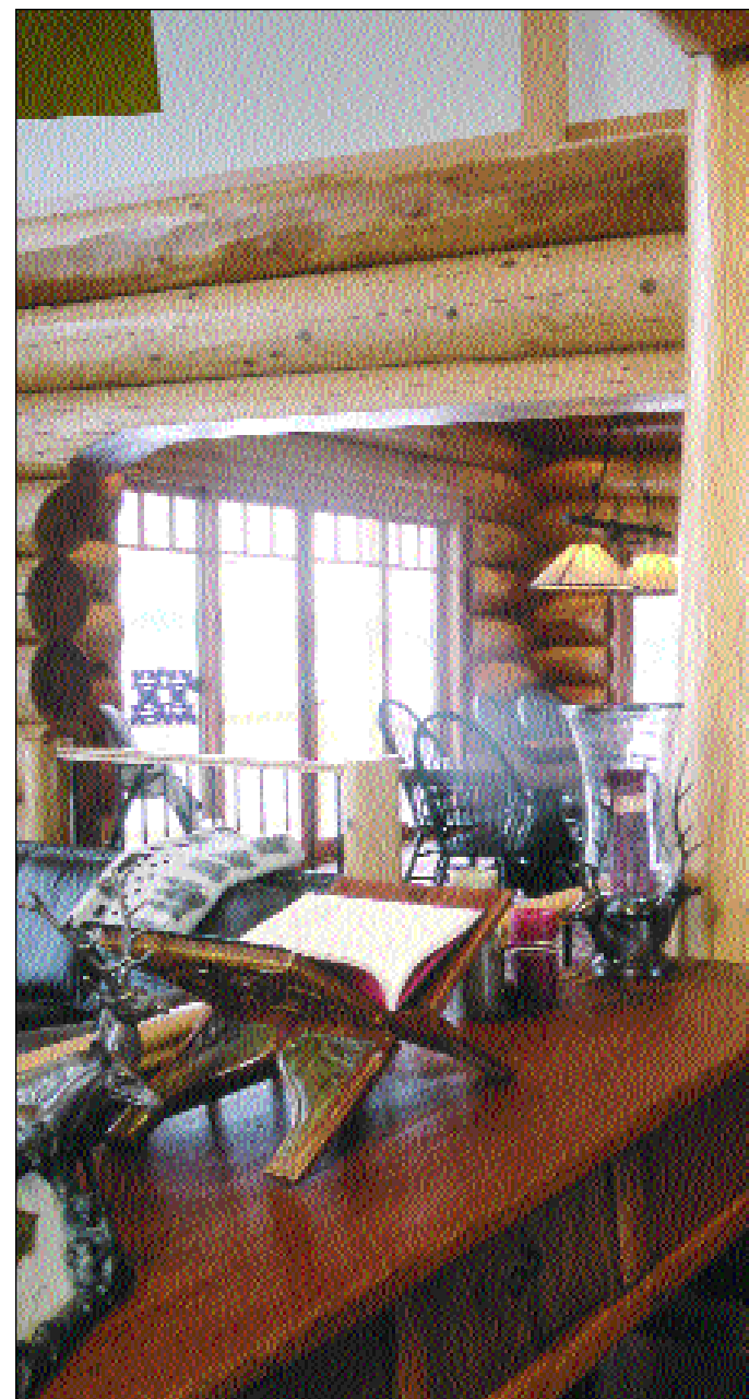
Space for entertaining and comfortable rooms where the family could relax were

“The owners followed suit and found real birch branches from the property to use as handles for the drawers,” Madejski says. “The piece, in every way, is totally specific to the house, the property and the owners.”