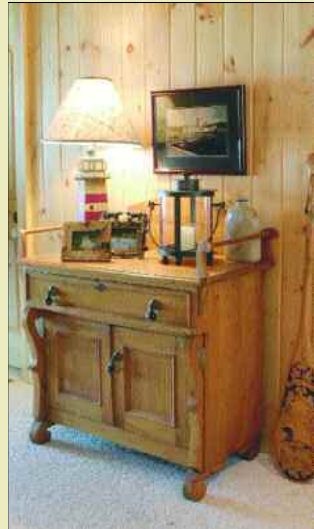
Creating a warm, cozy atmosphere – Inglenook cottage