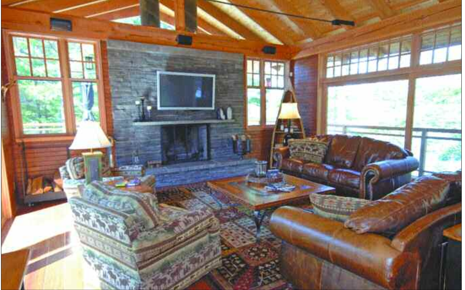
Rustic leather couches and stuffed chairs in the living room invite people in to relax and chat around the fire or watch TV. This room features a unique design in that a window is located above the fireplace, a design made possible by having two flues.